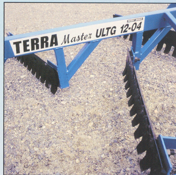
Heat Treated Serrated Grader Blades. Rear Heat Treated Straight Grader Blade.

The Shop Industrial shows you the future of terrain graders. We call it TERRA Master . You'll call it perfect. Gravel, slag, sand, loam, wood chips or dirt. Imagine a grader that makes even the roughest surfaces flat and smooth. When it comes to getting the job done, TERRA Master sets new standards in cost and work efficiency.