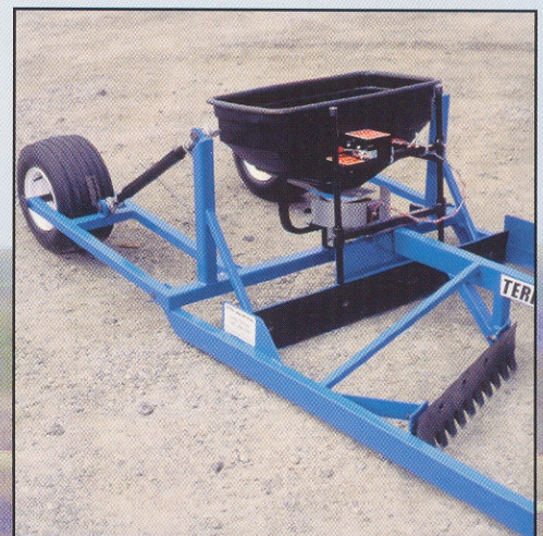
Optional Calcium Spreader