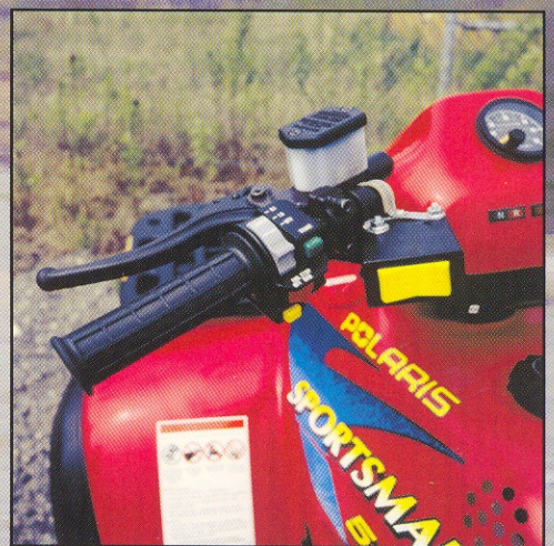
Handle Bar Mounted Control Switch

With TERRA Master, you can take on any grading challenge and conquer it . . . affordably!