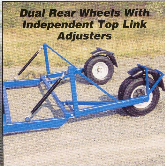
Dual Rear Wheels With Independent Top Link Adjusters